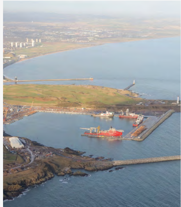
Amount invested: £35 million to create Scotland's largest port

The Marine Gateway is one of five zones within the ETZ that are each focused on leveraging the North East's critical mass of engineering experience, including specialised campuses focused on offshore wind,