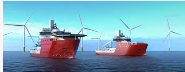
Amount invested: £35 million to expand its fleet of SOVs

Crucially, the skills that are needed to carry out the work required by regulation to maintain offshore wind platforms are closely correlated with the skills that have been used in decades of ERRVs in the oil and gas world. "Oil and gas is one of the most entrepreneurial parts of our industrial heartland and